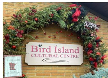
Community Christmas Market