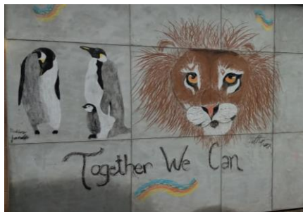
Public Sidewalk Chalk Canvas