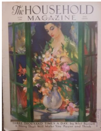
Household Magazine 1934